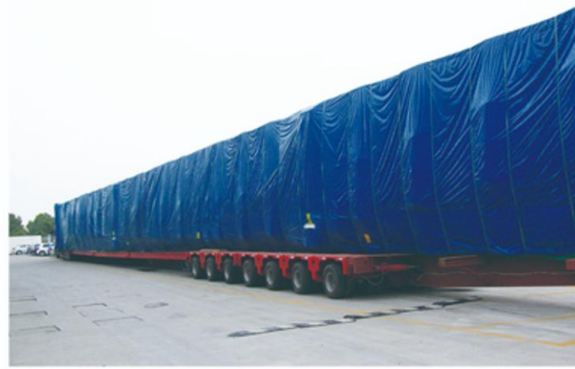
POL: Shanghai, China POD: Kandla , India COMM: 2 UNITS WIND MOULD DESCRIPTION: 163TON / 2624CBM 56.4*5.1*4 M