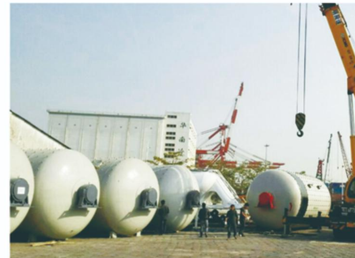
POL: Shenzhen , China POD: Odessa , Ukraine COMM: BOLL MILL DESCRIPTION: 14*40FR 9*3.8(4)*3.9M / UNIT 29Ton / UNIT