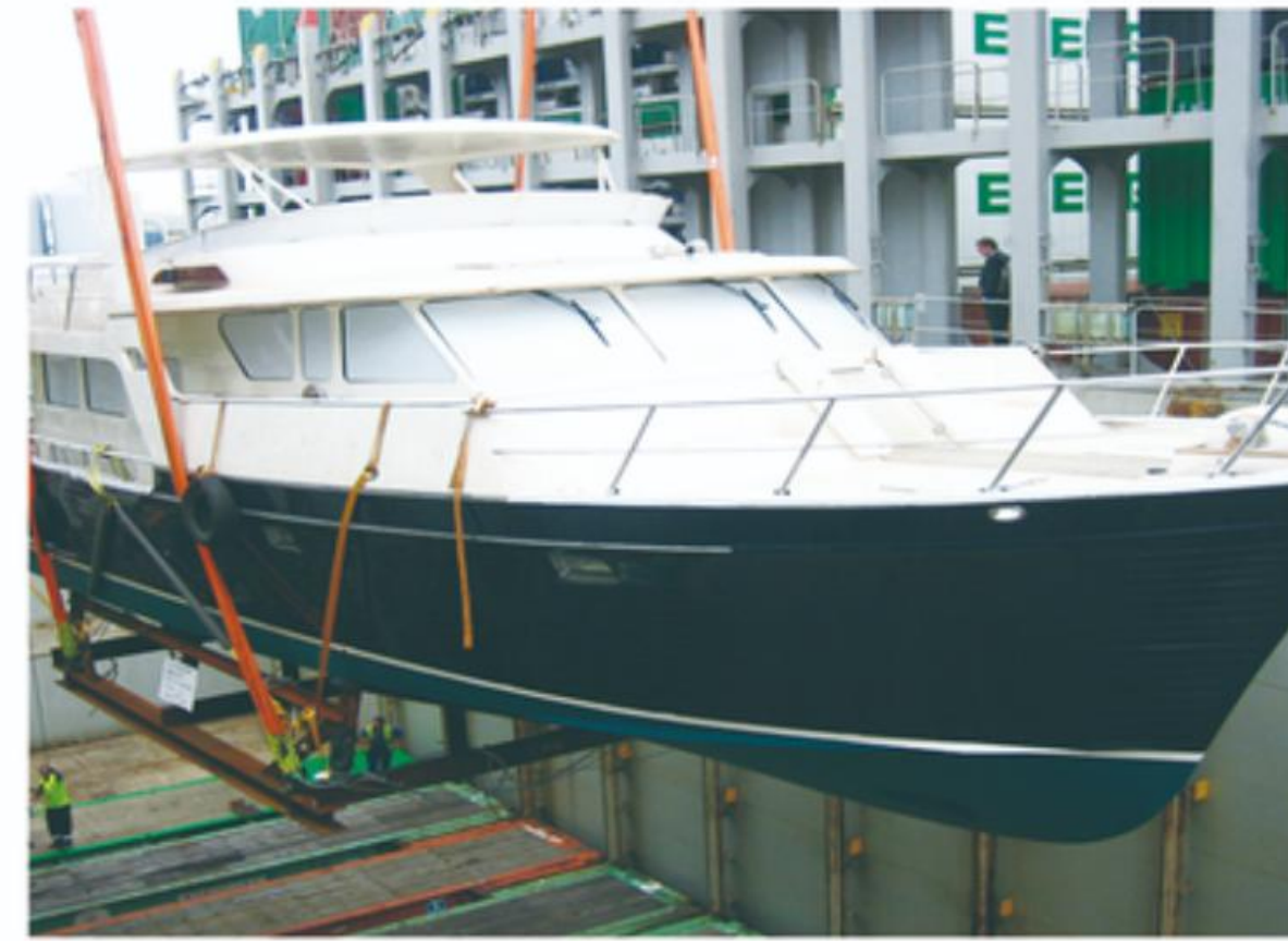
POL: Shanghai , China POD: Karachi , Pakistan COMM: Yacht DESCRIPTION: 446CBM/18.6TON 18*4.2*5.9 M