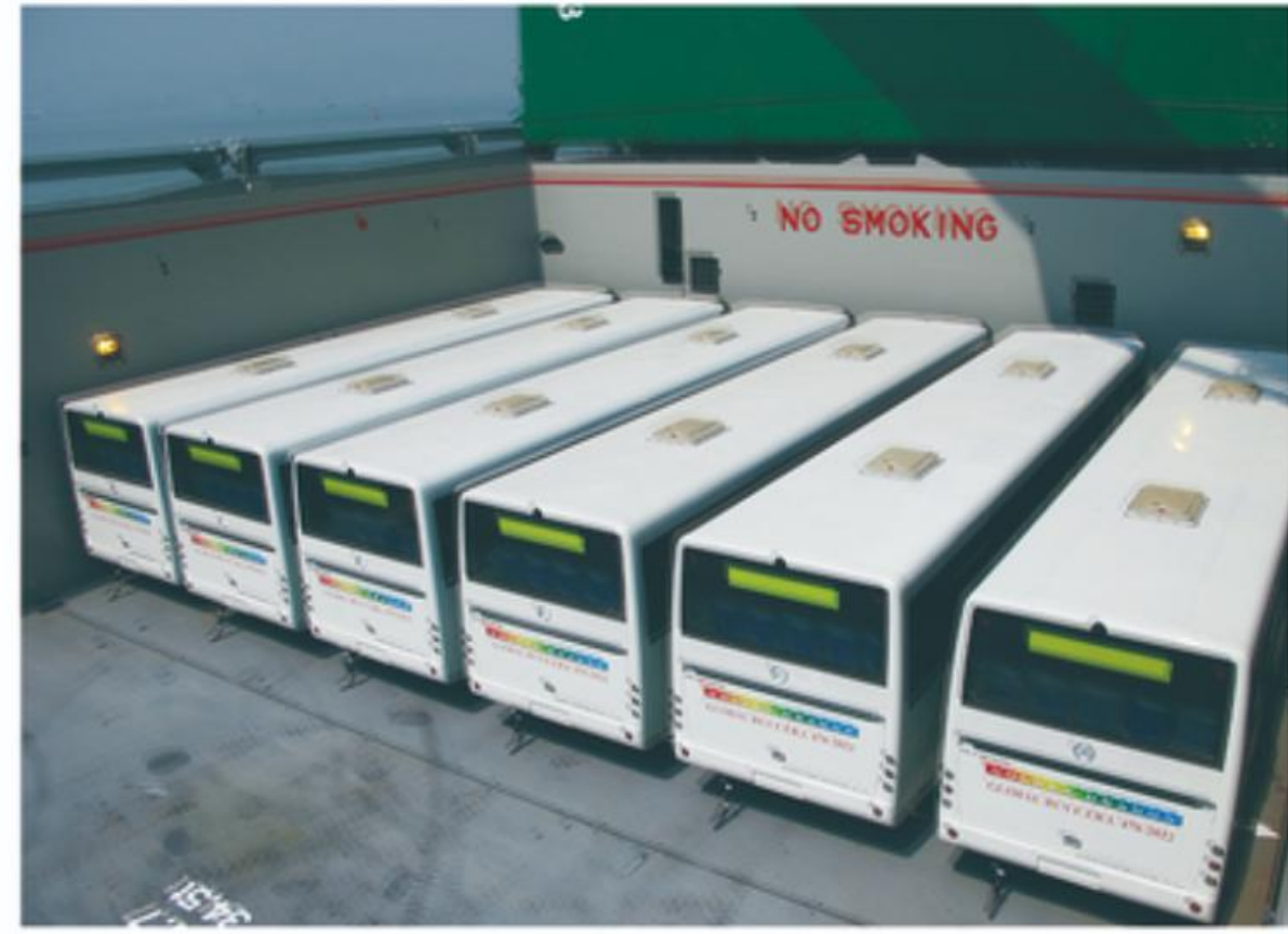
POL: Xiamen , China POD: Callao, Peru COMM: Buses DESCRIPTION: 5950TON 5332.52CBM 51 UNITS BUSES