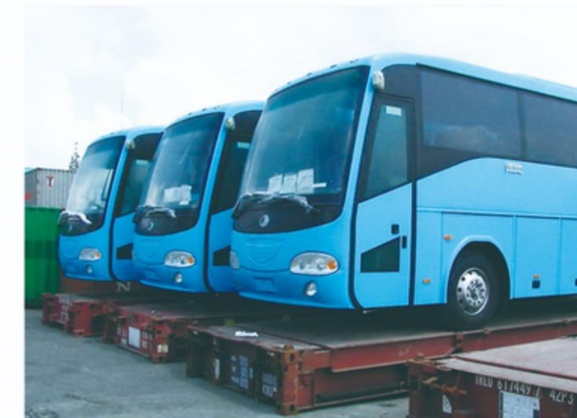
POL: Shanghai , China POD: Karachi , Pakistan COMM: Buses DESCRIPTION: 8*40FR 12*2.55*3.25M