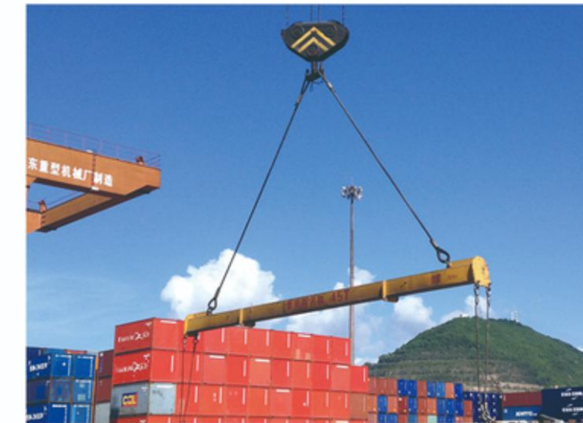
POL: Shenzhen , China POD: Shanghai , China FPOD: San Vicente , Chile COMM: Steel Structure DESCRIPTION: 655TON 1951CBM 32UNITS (40*0.6*2.5M/UNIT)