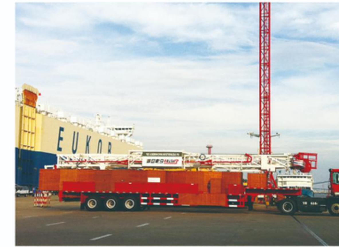
POL: Shanghai , China POD: Valparaiso , Chile COMM: 1 set workover rig DESCRIPTION: 115.5TON 455.35CBM