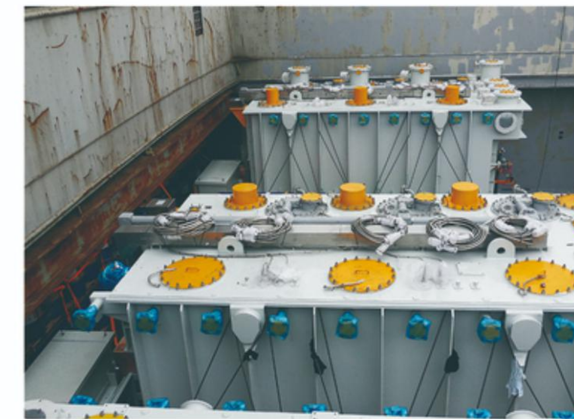
POL: Shanghai , China POD: Manila, Philippines COMM: Transformer DESCRIPTION: 306.5TON 684.15CBM 109TON(Heaviest)