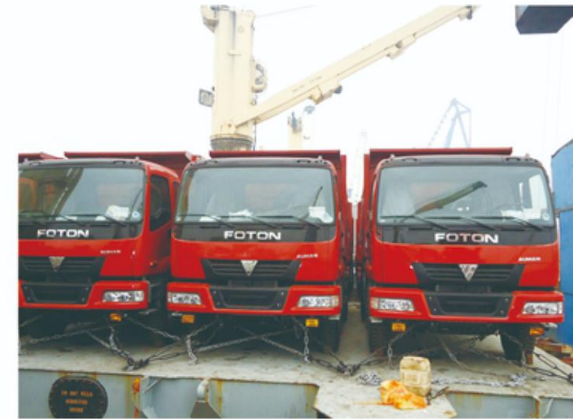
POL: Qingdao , China POD: Houston , USA COMM: Truck DESCRIPTION: 961.7CBM/228.9TON 23UNITS