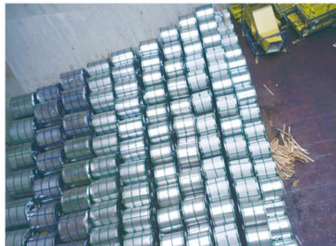
POL: Tianjin, China POD: Antwerp, Belgium COMM: Steel coils DESCRIPTION: 4897TON / 1089CBM