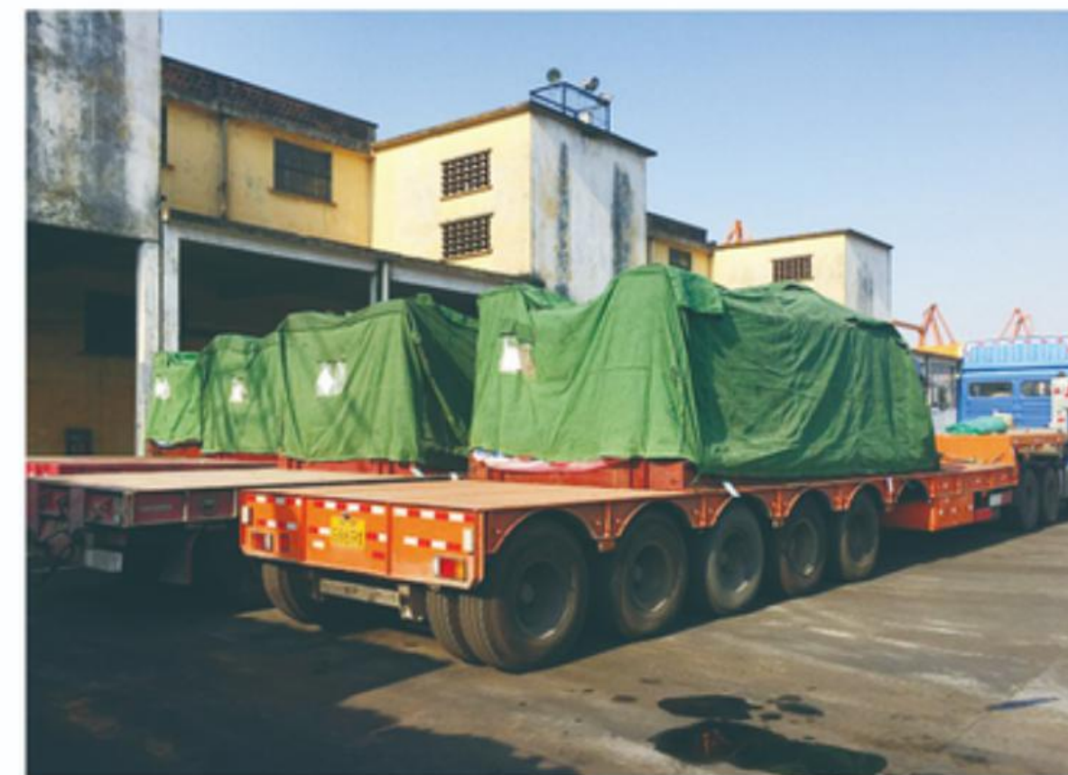
POL: Huangpu , China POD: Mundra , India COMM: 7 UNITS PRESS DESCRIPTION: 826TON / 324.3CBM 118 TON PER UNIT