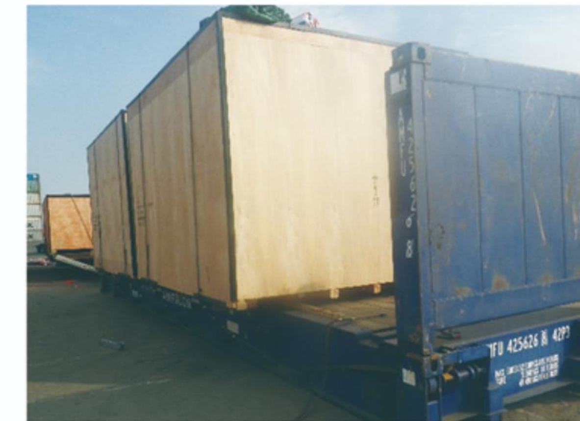
POL: Qingdao, China POD: Nhava Sheva , India COMM: ANNEALING FURNACE DESCRIPTION: 8*40FR 1*20FR 8*40HQ