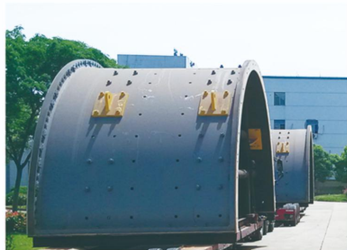
POL: Shanghai , China POD: Khorgos , Kazakhstan COMM: Steel Structure DESCRIPTION: 1321CBM/ 476TON 7.5*4.7*3.95M (max size)