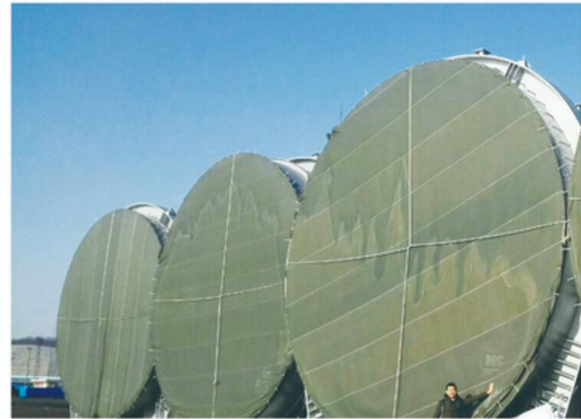
POL: Shanghai, China POD: Damman, Saudi Arabia COMM: Steel Construction DESCRIPTION: 258TON / 6528CBM 6Units 17*8*8M/UNIT