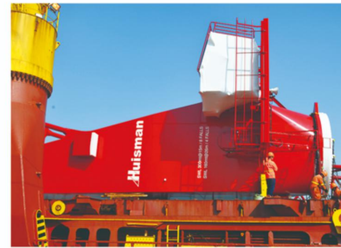
POL: Zhangzhou, China POD: Singapore , Singapore COMM: Crane DESCRIPTION: 3189.9CBM/239.82TON Heaviest 149TON Max Size 23.3*8*8.4M