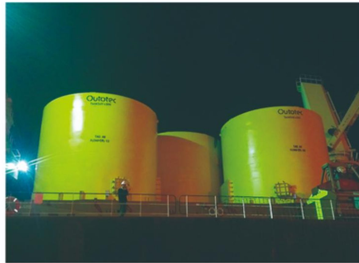
POL: Shanghai, China POD: Guayaquil, Ecuador COMM: Flotation cell DESCRIPTION: 190TON / 1500CBM