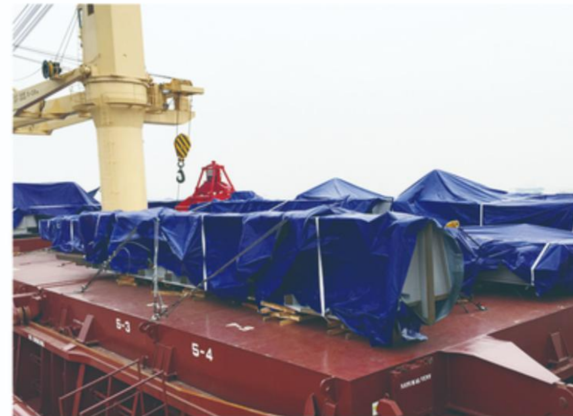
POL: Shanghai , China POD: San Francisco DO sul, Basil COMM: Module Steel Structure DESCRIPTION: 334.6TON / 2115.2CBM